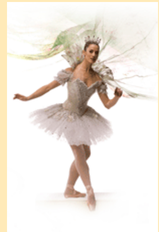
The Joffrey Ballet Cinderella February 17-28