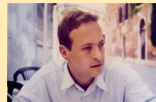
David Sedaris April 17