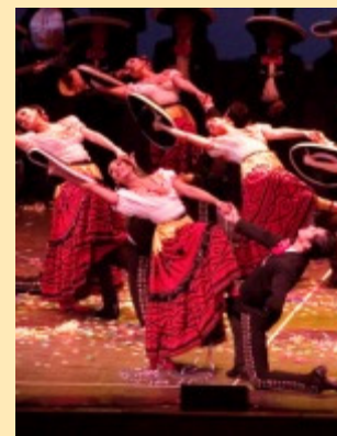
Ballet Folklorico de Mexico de Amalia Hernandez March 13 & 14