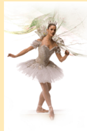
The Joffrey Ballet Cinderella February 17-28